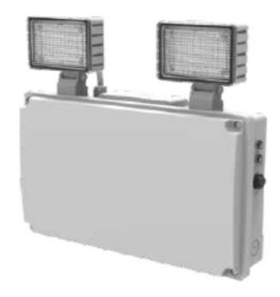
The X-PB3, a high output LED Twinspot providing a long lasting solution to Emergency Lighting in internal and external areas.